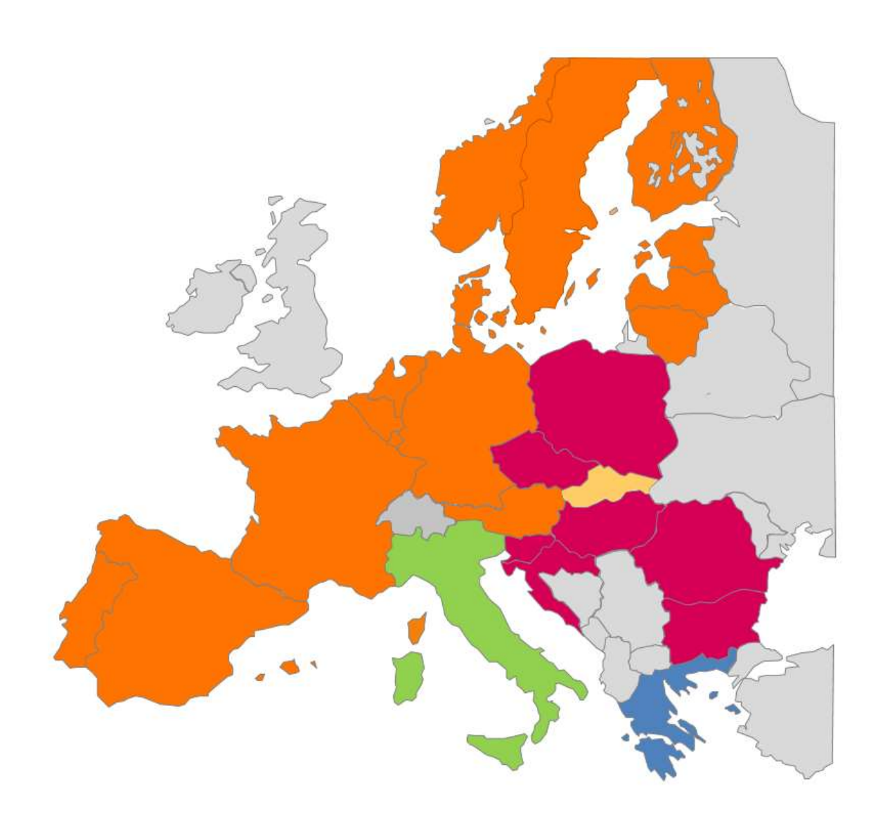
Picture 2: Countries coupled by SIDC solution in 1<sup>st</sup> Wave Go-Live, shown in orange (13<sup>th</sup> June 2018), in 2<sup>nd</sup> Wave, shown in purple (19th November 2019), in 3<sup>rd</sup> Wave, shown in green (planned in Q3 2021), in 4<sup>th</sup> Wave, shown in blue (planned in Q1 2022) and in 5th Wave (TBD), shown in yellow.

The bidding zone borders of the following countries (marked orange and purple) are currently managed by the SIDC solution. The Italian Northern borders (AT-IT, AT-SI and IT-FR) in green are due to go-live in Quarter 3 2021: